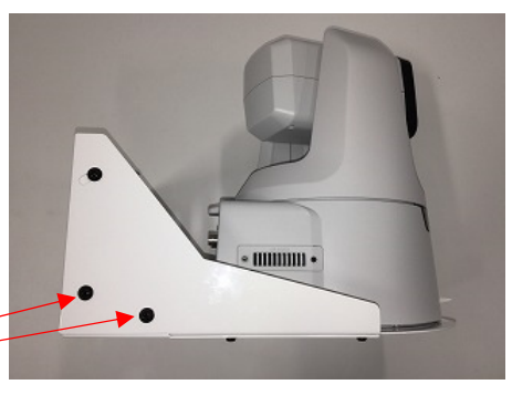
Fix 3 Screws temporarily, check center of 2 Holes, fix all 5 screws completely. Example 2) Canon CR-N500 Bracket(INVERTED)