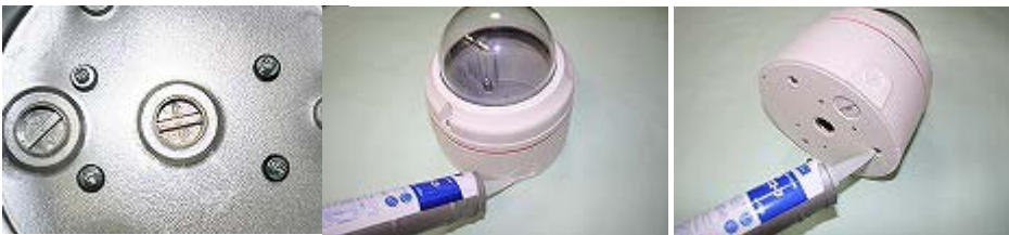
(Inside of Housing)